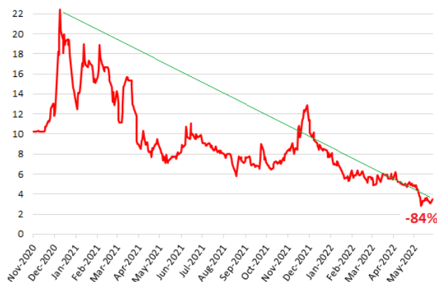
Canoo (GOEV) since SPAC Merger, USD

Canoo's shares have collapsed by 84% from their highs. The issue of new shares will prove to be dilutive and is therefore unlikely to generate a rebound in the stock - at least in the short term.