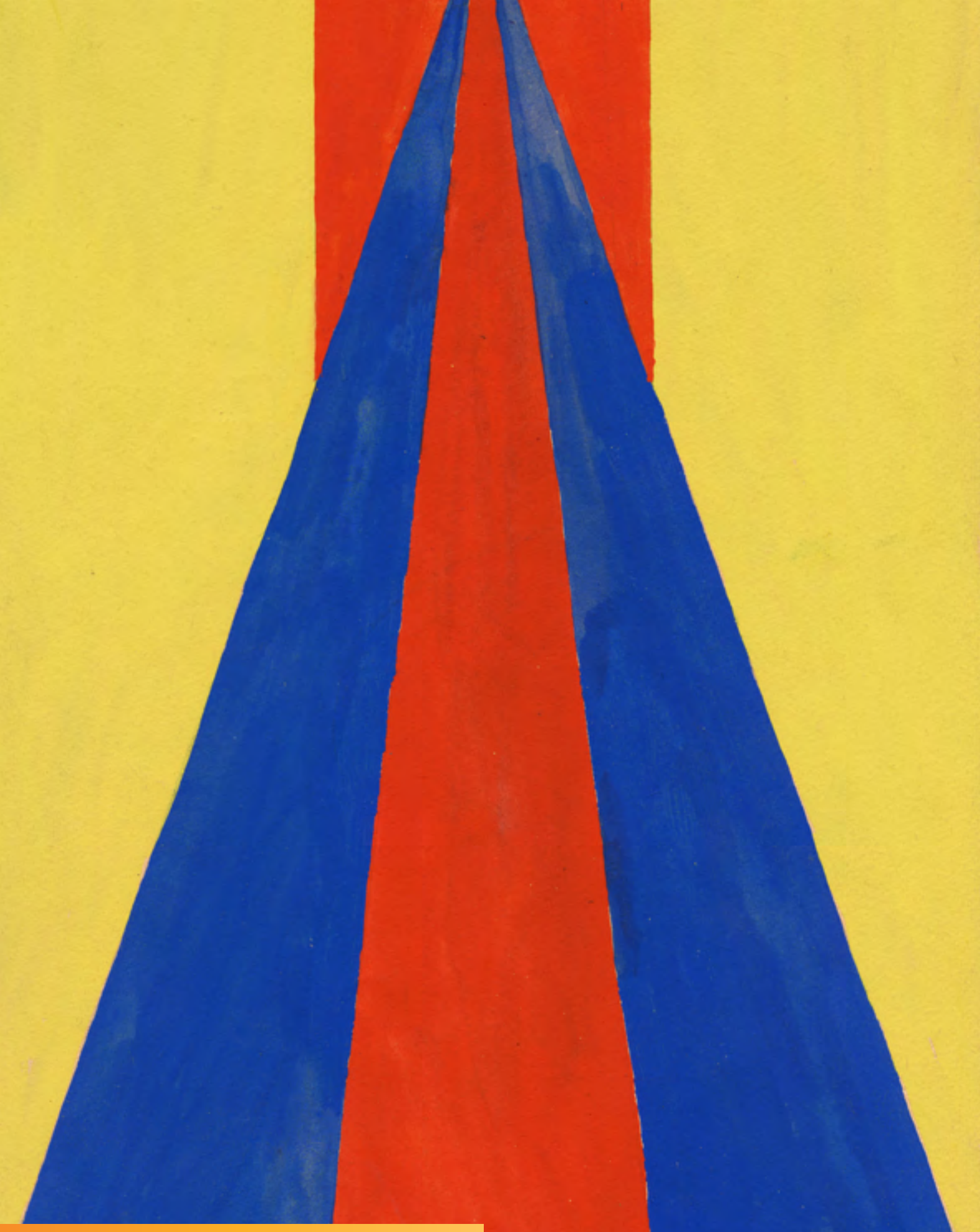
Heimo Zobernig – Untitled (1985) gouache on paper 21×29.7 cm