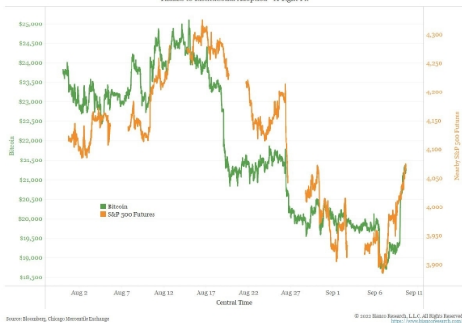
Bitcoin versus S&P 500 Futures Thanks to Institutional Adoption - A Tight Fit