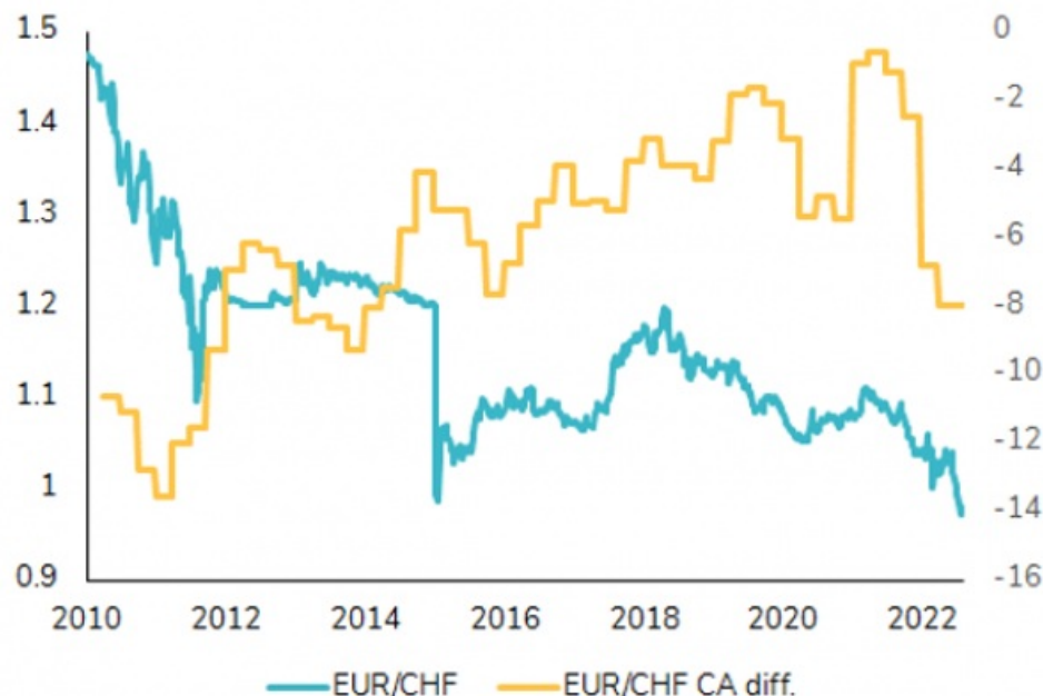
EUR/CHF and trade balance differential between the Eurozone and Switzerland

The next few months could therefore be characterized by European macroeconomic figures that are decidedly weak but in line with expectations, while Swiss figures could disappoint market expectations. This dynamic - if it materializes - would favor a stabilization of the EUR/CHF.