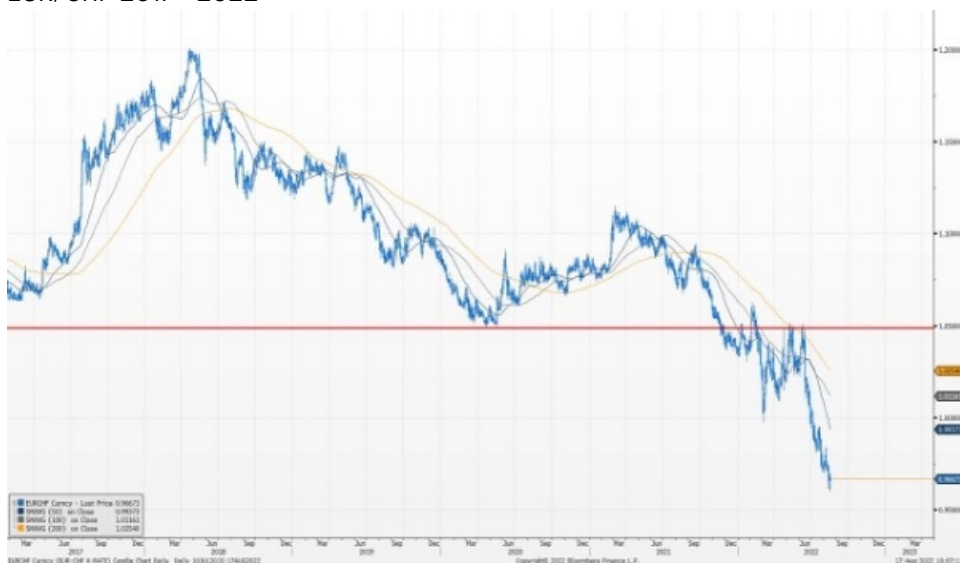
EUR/CHF 2017 - 2022

The depreciation of the euro against the Swiss franc accelerated over the summer, with the EUR/CHF falling from 1.037 in mid-June to 0.96 in mid-August, a depreciation of almost 7% in two months.