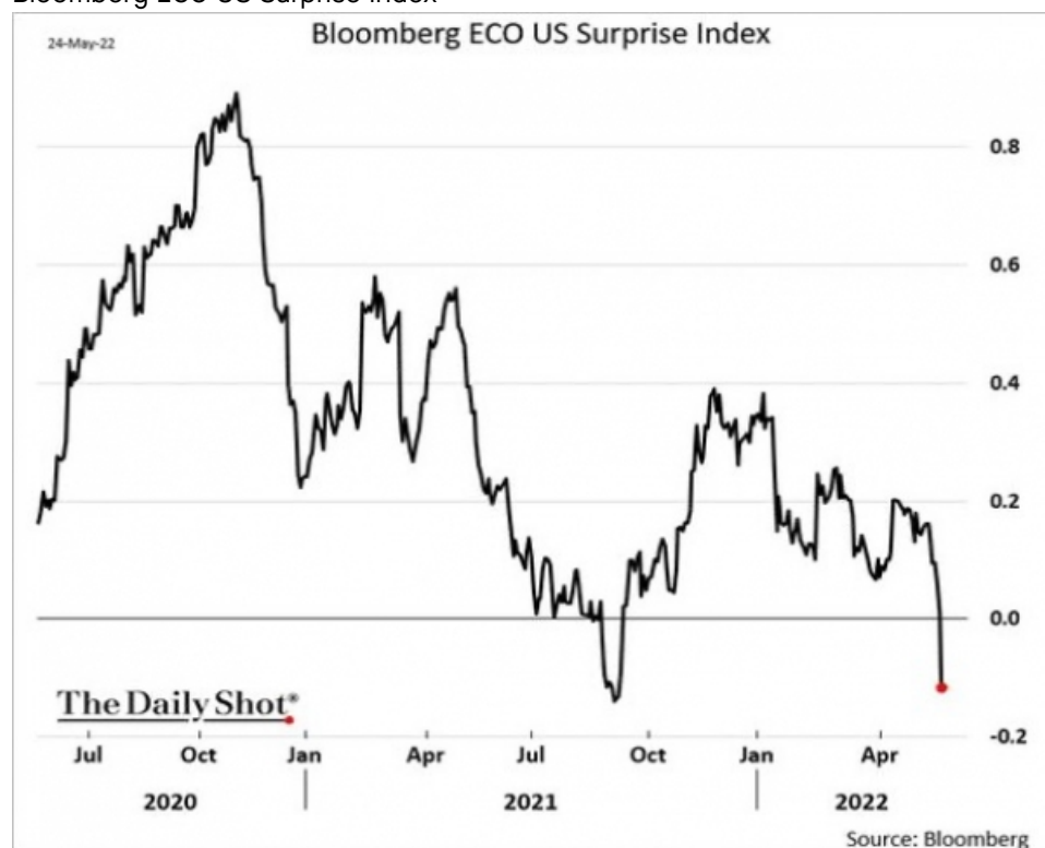
Bloomberg ECO US Surprise Index

Another factor that led to positive performance in the equity and bond markets last week was the fact that recently released macroeconomic figures were below investors' expectations. The US economic surprise indicators point to a sharp slowdown in US growth. These bad figures suggest a lower than expected number of rate hikes, which delights the markets. Bad news becomes good news in a way.