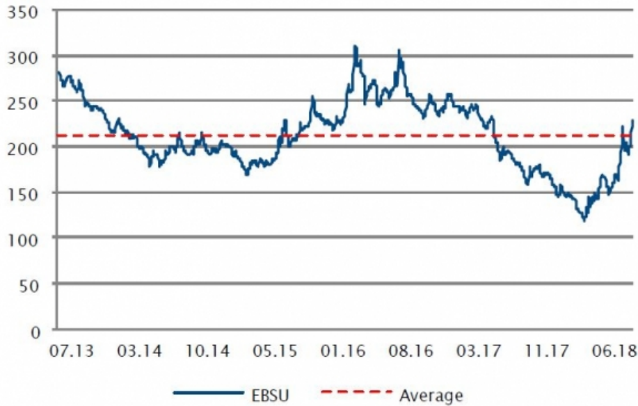
EBSU option adjusted spread and average

The bullishness in credit markets we saw at the end of 2017, which continued into the first weeks of January 2018, got abruptly disrupted by inflation fears, followed by trade concerns that were seen as a potential threat to global growth and finally political uncertainty in Italy. The result was a widening of spreads across credit sectors that did not leave banks unaffected. The banking sector of the European financial subordinated index ( ICE BofA European financial subordinated index (EBSU) ) reported a spread widening of approximately 65 basis points from 140bps at the start of January to 207bps at the 25th of July.